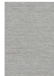
SURFACE & EDGE Satin Stainless