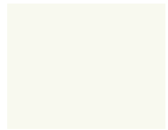
PAINT, EDGE & SURFACE WF