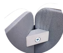
2x Corner Brackets