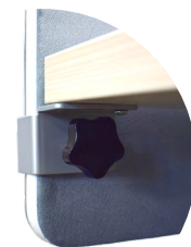
1x Surface Bracket