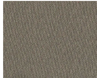
FABRIC OPS Brown's Island