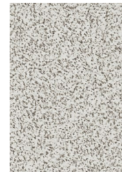
SURFACE & EDGE White Nebula