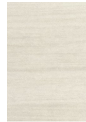
SURFACE & EDGE White Cypress