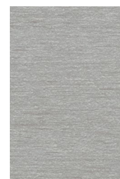
SURFACE & EDGE Satin Stainless